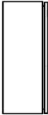
EKM705020 | 700H 500W 200D, IP66 Electrical Enclosure